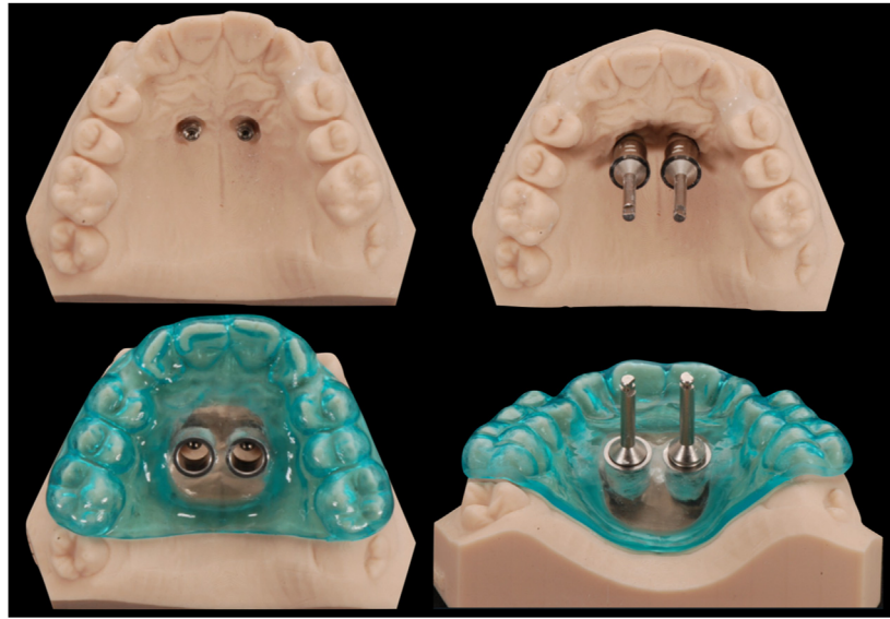
Fig 3. A, STL file with planned miniscrew position. B, Intraoral scan with scan body. C, Superimposition. Second intraoral scans were generally obtained 4-6 weeks after digital planning.

whereas categorical variables are reported as the number and/or percentage of subjects. The normal distribution z-test was used to determine the power of the sample, and the null hypothesis was that the mean of paired differences was equal to 0. The power analysis found that a sample size of 8 achieves 95% power to detect a mean of paired differences of 3.00^\circ with a known standard deviation of differences of 2.00 and with a significance level ( \alpha ) of 0.05 using a 2-sided paired z-test. Differences in the angle determined by the mutual position of 2 screws in the space with respect to the 3 different settings were tested with the Wilcoxon's signed rank test adjusted using the Bonferroni method. Differences with a P value of <0.05 were selected as significant. Data were acquired and analyzed in R statistical software (version 2018; R Core Team, Vienna, Austria).