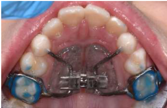
Fig. 1. Haas-type expander.

incisors. 18 Mutinelli et al. emphasized the viability of using deciduous teeth as anchors for heavy forces during RME treatment, proposing it as an effective strategy to address transverse maxillary deficits. 18–19 RME anchored to deciduous molars may also offer advantages in hyperdivergent subjects by controlling vertical dimensions and counteracting changes in mandibular posture during expansion, particularly when RME is anchored to permanent teeth.