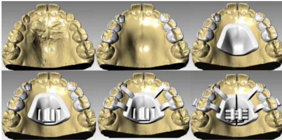
Fig. 2. digital phases of the design of the HIRME expander.

The increase in surface and volume was significant for the Haas and the Hirme appliances ( p < 0.001 ), while no significant differences in surface or volume increase were found between the two devices (Haas: p = 0.365 ; Hirme: p = 0.354 ).