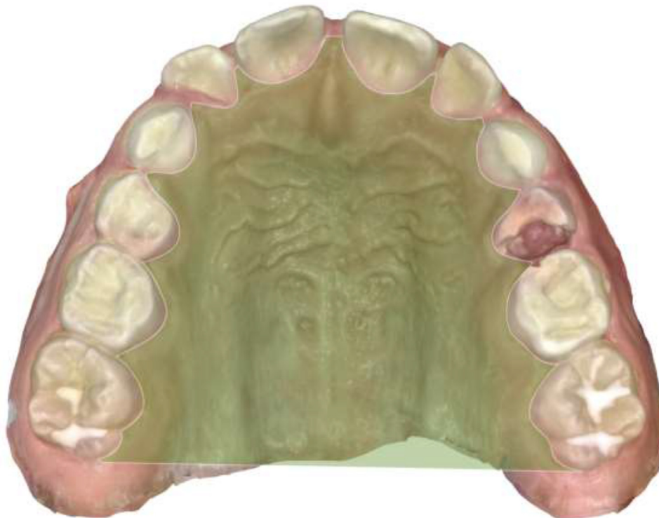
Fig. 3. Visual representation of the reference points used for surface calculation.

The methodology used in this study, that is, three-dimensional analysis of models derived from a digital impression, allows an in-depth study of all dimensions of the palate, without sacrificing detail but avoiding patient exposure to additional radiogenic doses. All with a focus on patient comfort and a highly cost-effective approach.