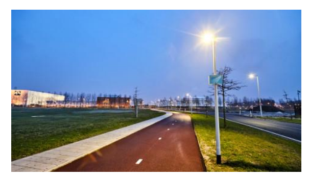
Fig. 2. DC powered lighting system in the port of Amsterdam