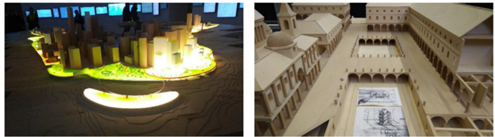
Figure 2. Left: Humanhattan 2050, by Bjarke Ingels Group, photo: Borruso G, “Biennale”, Venezia, 2018. Right: Leonardo, mockup of a “Città ideale” (Ideal City), photo: Borruso G, Trieste, 2019.