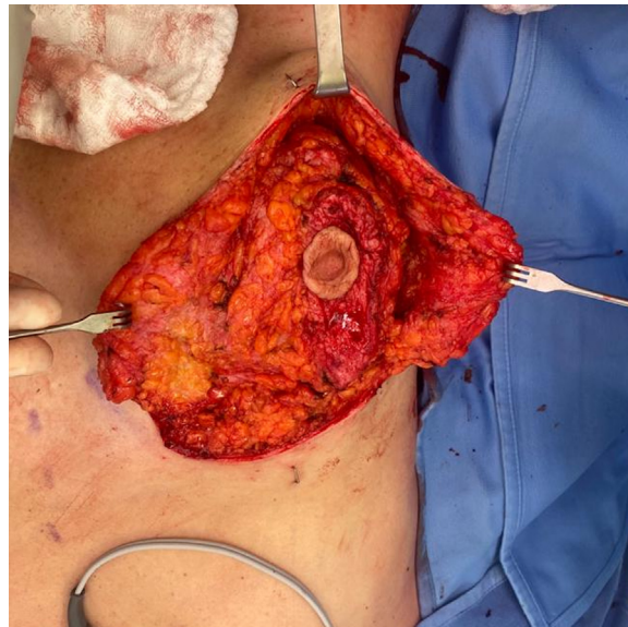
Figure 3 Intraoperative detail: the same technique is carried out on the contralateral side

report (within 1 month from the surgery). All patients underwent radiation therapy on the breast cancer side, as per standard protocol. Patients' demographics and comorbidities, operative details, postoperative complications were recorded. In addition, a pre- and postoperative Breast-Q questionnaire (breast conserving therapy module) was given to all the patients before the surgery, 3 months and 9 months after and the following parameters were analyzed: wellbeing social setting, sexual well-being pre-post, physical wellbeing of the chest, satisfaction with breasts. The statistical analysis with \chi^2 test was performed.