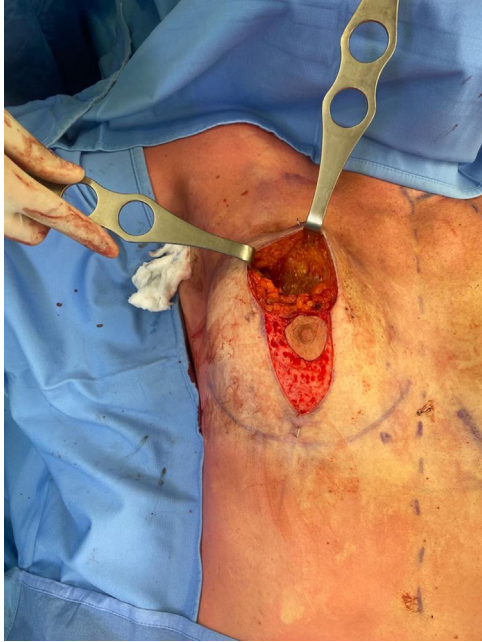
Figure 1 Intraoperative detail after upper pole quadrantectomy