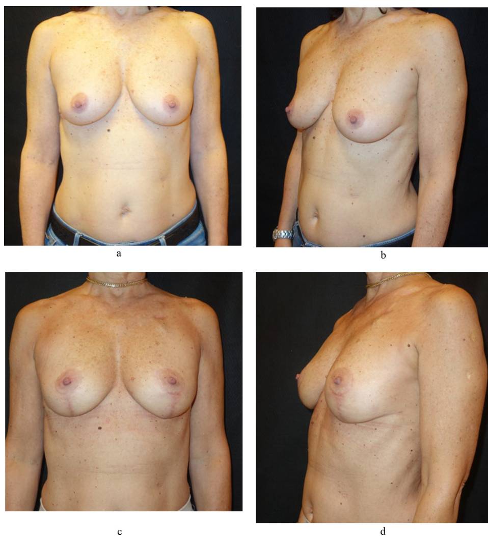
Figure 5 Cancer of the inner-upper pole of the right breast; preoperative frontal views (5A, 5B) and results after 12 months follow-up