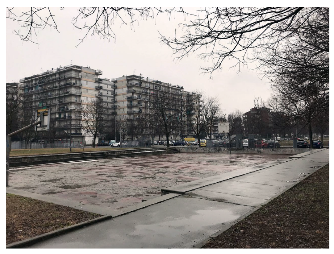
Figure 2. Built environment of Satellite neighbourhood, Pioltello.

region with the highest number (~9,000) and share (25 per cent) of foreign-born residents (Di Giovanni and Leveratto, 2018). There are over 100 nationalities represented in Pioltello with Egyptian, Romanian, Pakistani and Ecuadorian the most common groups.