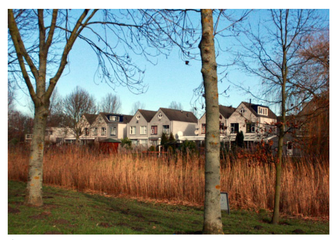
Figure 6. Low-rise residential buildings in Almere.

Drawing attention to the salience of the label post-suburbia to understanding patterns and processes of contemporary urbanization in both conceptual and empirical terms, this paper presents a comparative analysis of two specific European contexts: Pioltello, in the urban region of Milan, and Almere,