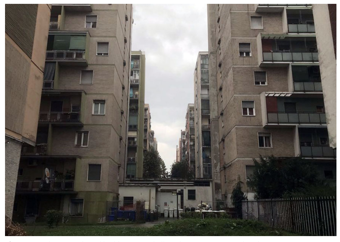
Figure 5. High-rise residential buildings in Pioltello.

The socio-spatial transformations that have taken place, and continue to do so, within metropolitan Milan and Amsterdam point to the emergence of 'post-suburban blend-scapes'. This is reflected, for example, in the different housing morphologies between (and within) the Satellite neighbourhood in Pioltello with its high-rise apartment complexes (figure 5), and the low-rise residential buildings of Almere (figure 6).