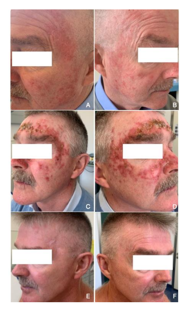
Figure 3. Example of patient with more than six actinic keratoses on the face treated with 4% 5-Fluorouracil cream. ( A , B ) Clinical presentation of multiple AKs before treatment. ( C , D ) Common side effects with 5-FU 4% cream: erosion, erythema and scabs. ( E , F ) Complete response after six weeks of treatment.