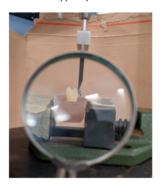
Figure 1. SBS testing with stationary magnifier.

Using a universal testing machine (AGS-X 10, Shimadzu Corporation, Kyoto, Japan), SBS testing was performed. A chisel-shaped loading device was used to apply a shear force with a crosshead speed of 1 mm/min parallel to the bracket's surface. To make sure that the force was applied parallel to the surface, a stationary magnifier was used (Figure 1).