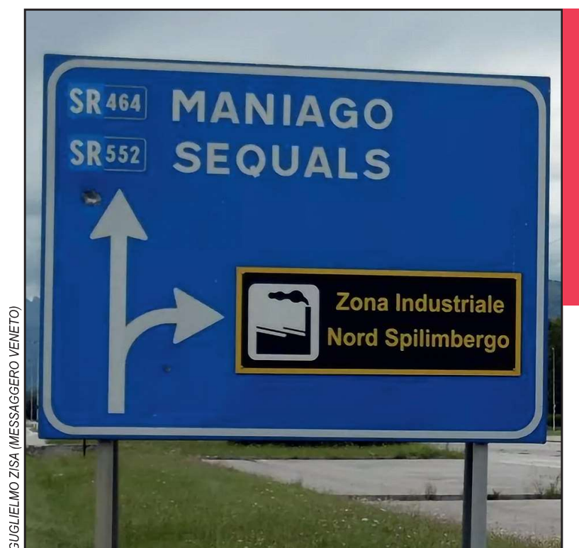
The industrial zone north of Spilimbergo – the fusion between the Consortium of Ponte Rosso and the Consortium of Spilimbergo.