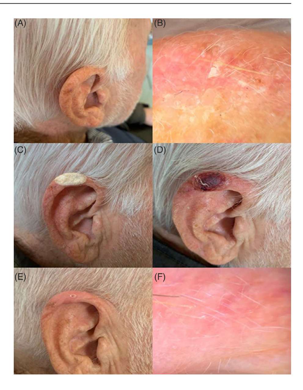
FIGURE 3 Side effects developed during 5-FU 5%/SA 10% therapy

FIGURE 2 AK before (A and B), during (C and D) and after (E and F) cryotherapy and its dermatoscopic patterns