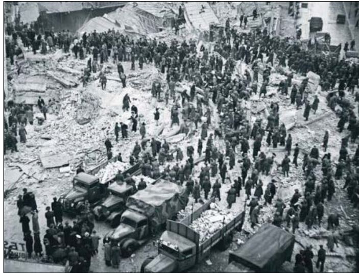
National Geographic Romania