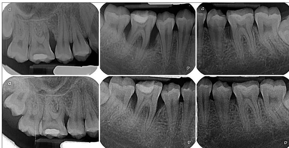
Figure 2: Periapical radiographs comparing baseline condition (upper line) with the situation 1 year after nonsurgical and pharmacological therapy (lower line)