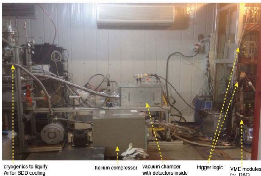
Figure 2. A picture of the VIP-2 setup in the barrack at LNGS .

In November 2015, the VIP2 setup was installed at Gran Sasso [11]. In the year 2016, data with the complete VIP2 detector system at the LNGS without shielding were taken. In Figure 2 the VIP2 setup as installed at LNGS is shown.