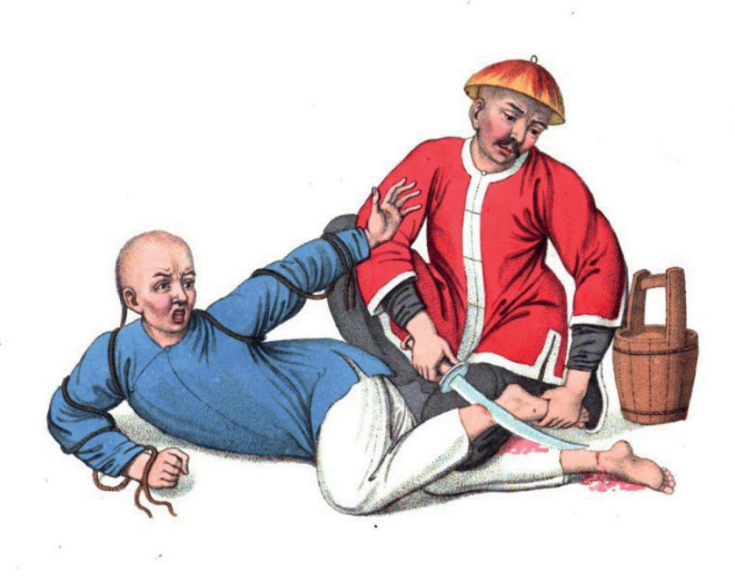
FIGURE 6 – George Henry Mason, The Punishments of China (1801), "Plate XVII. Hamstringing a Malefactor. This punishment is reported to have been inflicted upon malefactors, who have endeavoured to make their escape. A vessel containing Chunam, a species of mortar, is at hand, to be applied, by way of styptic, to the wounds. It is said, that this punishment has been lately abolished, the legislature considering, that the natural inclination for liberty, merited not a chastisement of such severity"

and with the systematic use of cruel "celestial castigation" would become common in nineteenth-century European representations of China.<sup>258</sup>