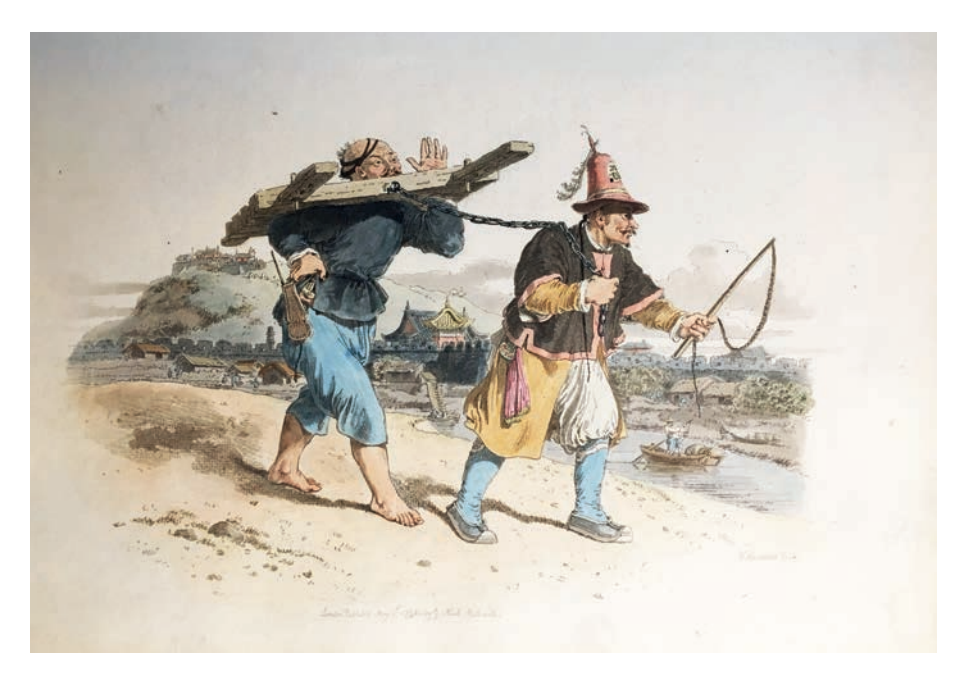
FIGURE 4 – William Alexander, The Costume of China (1805), "Punishment of the Cangue. By which name it is commonly known to Europeans, but by the Chinese called the Tcha"