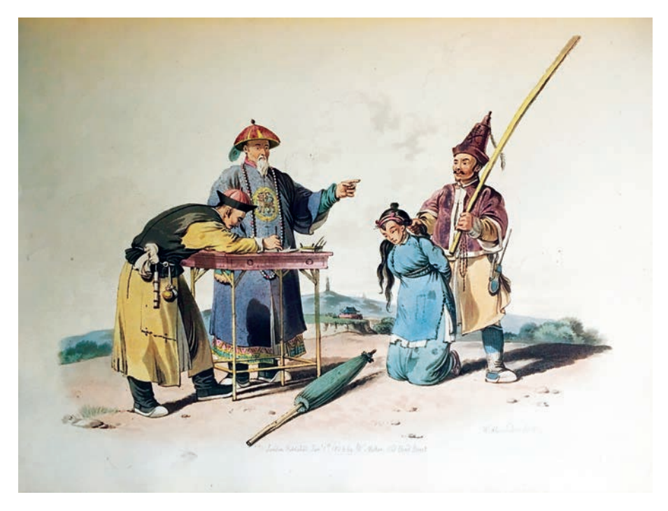
FIGURE 3 – William Alexander, The Costume of China (1805), "Examination of a culprit before a Mandarine"