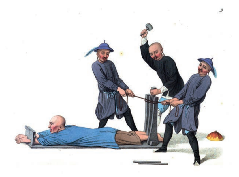
Figure 5 – George Henry Mason, The Punishments of China (1801), "Plate IX. The Rack. This horrible engine of barbarity and error is not peculiar to Roman Catholic countries, it is used even in China, for the purpose of extorting confession"

the criminal. Even without coarse imagery, Mason's plates thus present Chinese justice as arbitrary, ingeniously cruel and lacking in humanity, with no respect for the physical or moral person of subjects and incomprehensively demeaning to their dignity through the imposition of useless, painful and humiliating punishments.