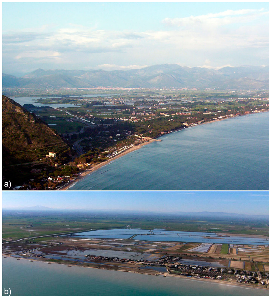
Figure 1. The Italian coastal areas are characterized by important human settlements that are sensitive to sea level rise: (a) the Fondi Plain, near Latina (Latium, Italy) is one of the 33 areas of the Italian coastal zones prone to marine flooding (Lambeck et al., 2011); (b) the Mouth of Carapelle river, near Foggia (Apulia, Italy) with damaged wetlands after the sea-storms occurred on February/March 2009.

according to Church et al. (2013) and Rahmstorf (2007) projections and include the rates of glacio-hydro-isostasy estimated by Lambeck et al. (2011). Our goal is to provide detailed maps (M1, M2, M3, and M4) of potential marine flooding scenarios at four densely urbanized and populated Italian coastal areas for the year 2100. The areas include the northern Adriatic and the coastal plains of Oristano, Cagliari, and Taranto (Figure 3).