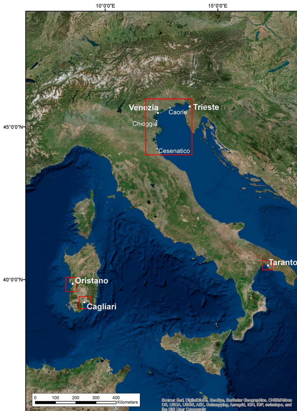
Figure 3. The four Italian areas investigated in this study, characterized by coastal plains and geo-diversity.

ISPRA network, 2000–2013 series) (Antonioli et al., 2017). Even though, the more recent values are not representative for the long-term trends due to sea level variability, both the tidal data and the cGPS data confirm a trend of land subsidence, in agreement with the geological data shown in Antonioli et al., 2017.