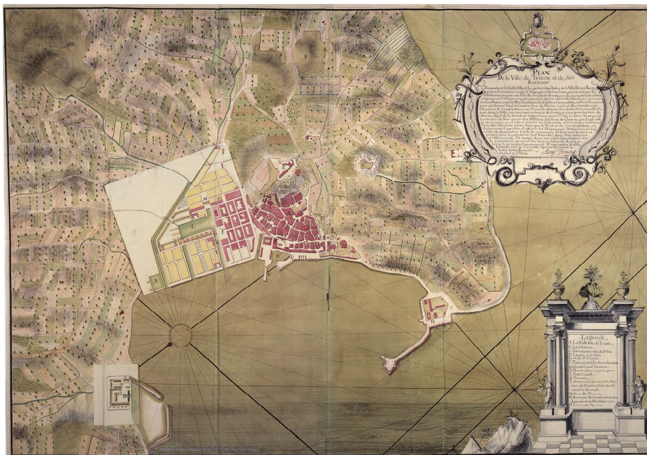
Figura 2 "Plans de la ville de Trieste et de ses environs", 1765, (source P. Di Biagi, V. Fasoli, A. Marin, Dalla città moderna alla città contemporanea. Piani e progetti per Trieste, Udine, 2002)