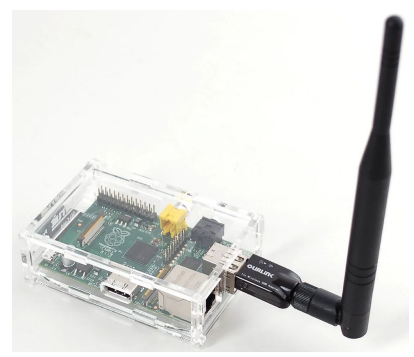
Figure 2: Hardware platform implementing the evil twin used in our experiments (the battery is omitted).

The legitimate network at our University is based on PEAP-MSCHAPv2, is part of eduroam and its SSID is eduroam. The certificate chain for the Authentication Server is composed of 3 certificates: