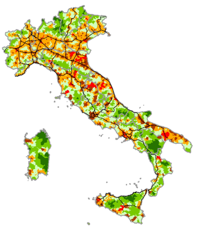
Figure 1. Classification of municipalities according to degree of remoteness.