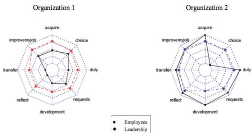
Figure 1. Individual level