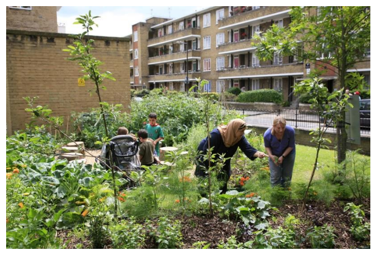
Figure 1: Brookwood Edible Garden, London.

As an example, let us take the Brixton Abundance project in London. The vague land surrounding the buildings has been used as a space to plant vegetable gardens for local citizens. The success and the wide interest raised by this initiative have opened the question of the involvement of non-residents, too, and of how to manage and distribute the produce (e.g., Figure 2).