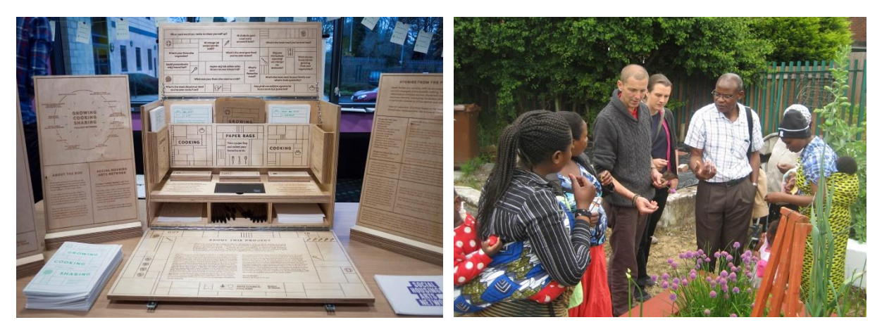
Figure 4a, 4b: In the Growing | Cooking | Sharing project, the exchange of recipes (4a), the cultivation of vegetables (4b) and the preparation of ethnic dishes become a way to encourage the inhabitants of different ethnic groups to get to know each other.

Inclusion strategies have been oriented, on the other hand, to facilitate the inclusion of disadvantaged people (unemployed, immigrants, disabled people, etc.) in the community through the sharing of food production, distribution and consumption experiences. In other cases, their goal was to promote the integration of people of different ethnic origins, food handling being a possible common ground for mutual exchange and even friendship. The Bolton at Home association and the Social Housing Arts Network have started their Growing – Cooking – Sharing project, focussed on social housing. Artist Sarah Butler engaged the inhabitants and new residents (especially those from immigrant backgrounds) of Breightmet, Bolton, in a "getting to know your neighbour" experience through activities like cultivation of vegetables and cooking of traditional dishes belonging to the various national cuisines (e.g., Figure 4a, 4b). An exchange of experiences and contextual knowledge has promoted social closeness and reduced the distance among cultures, even those very distant from each other (Internet 9).