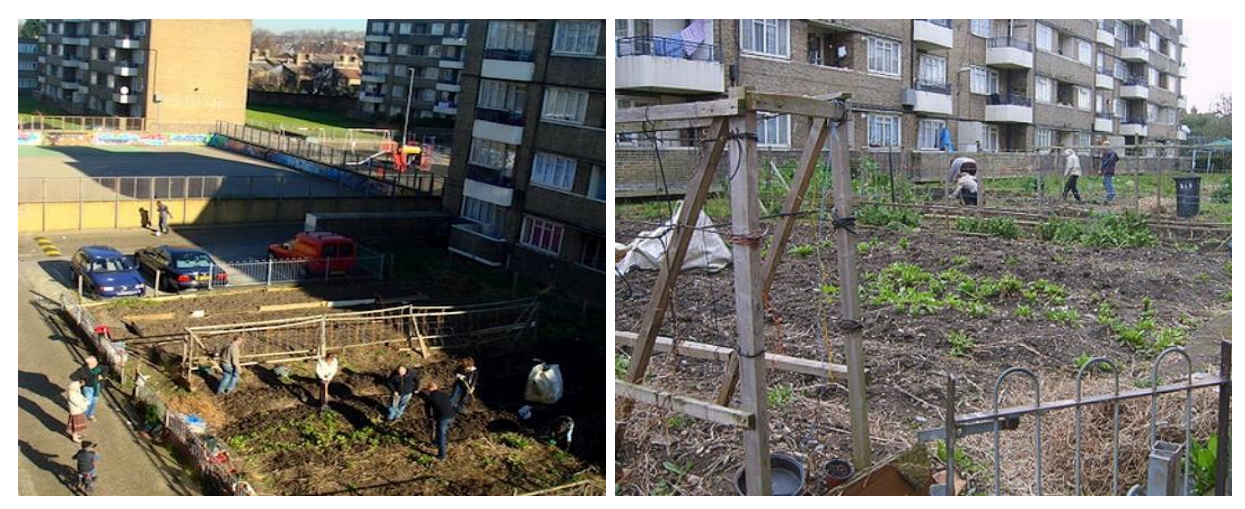
Figure 2: Abundance project: urban agriculture demonstration plot on social housing estate maps the way forward for community food. Brixton, London.

As an example, let us take the Brixton Abundance project in London. The vague land surrounding the buildings has been used as a space to plant vegetable gardens for local citizens. The success and the wide interest raised by this initiative have opened the question of the involvement of non-residents, too, and of how to manage and distribute the produce (e.g., Figure 2).