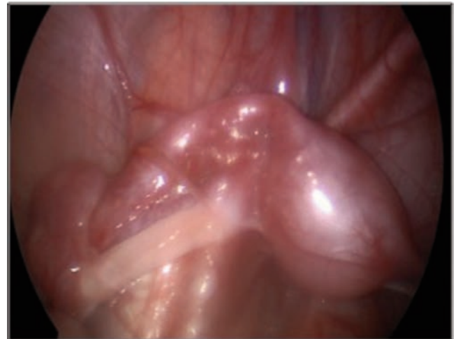
Figure 2. Laparoscopic image of streak gonad.