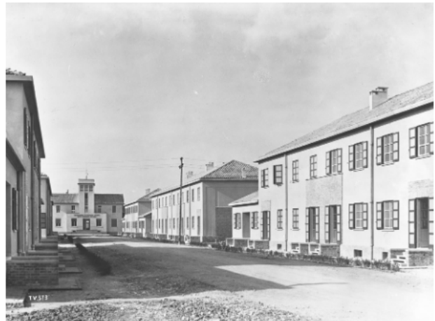
Figure 16. Workers' houses type 4-BIS in 1948, Torviscosa, IT.

First of all, the quarry of Cave del Predil and the plant of Torviscosa surrounding areas are still tackling relevant environmental issues resulting from the heavy impact and pollution of the former industrial activities (mining and chemical production), so that brownfields reclamation needs are constantly discussed as a priority.