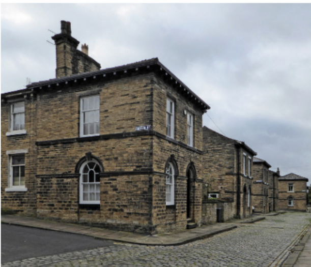
Figure 8. Houses in Saltaire, UK (Tim Green, 2017).