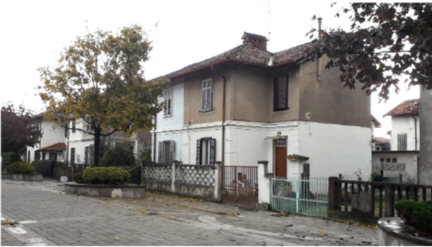
Figure 15. Panzano workers' houses after renovation works (authors, 2019).