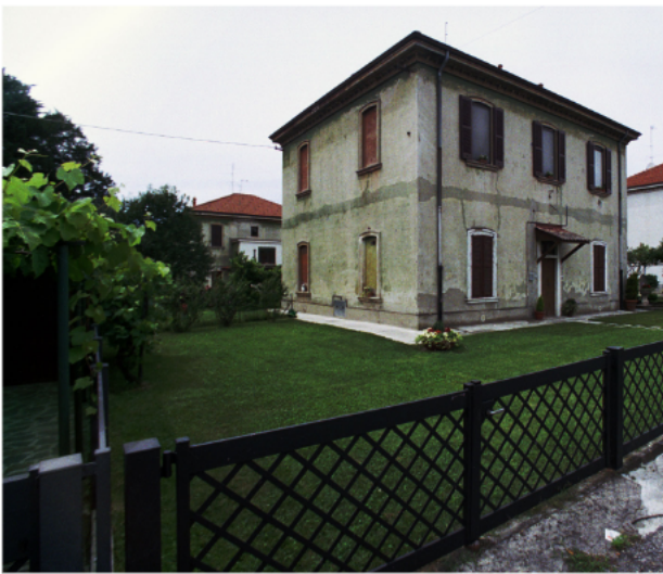
Figure 10. Worker's house in Crespi d'Adda, IT (Ian Spackman, 2007).

comfort, and environmental sustainability. In this sense, the national and local public bodies involved in the field of cultural heritage have sometimes introduced generic guidelines for the conservation and renovation of the historical housing stock, in some cases also suggesting the appropriate solution for specific building components (e.g. guidance to repair and upgrade traditional windows by Historic England (Wood et al., 2017) or the homeowners' guide for the model village of Saltaire (Bradford District Council, 2007)). In Italy, several credible initiatives at local (regional or municipal) level have also promoted agendas for the typological renovation of workers' houses with criteria and guidelines specifically drafted for each settlement, as it is exemplified by the detailed plan for the city of Carbonia (Comune di Carbonia, 2016), and by the 'restoration manual' for the Crespi D'Adda company town (Gasparolo and Ronchi, 2015). However, those guidelines, recommendations and specifications appear mainly focused on the restoration practices and paid poor attention to the aspects of energy retrofit of the built heritage, which do play a key role in current regeneration strategies.