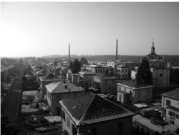
Figure 3. Crespi d'Adda site, aerial view, 2009.

Then, three company towns in the local area have been presented as case studies for the application of possible retrofitting strategies on the residential heritage.