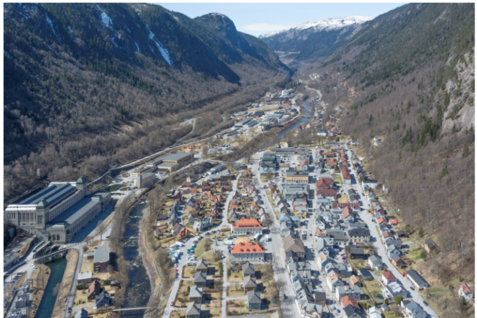
Figure 11. New Town (house type O), Market square and Tyskerbyen housing area, Rjukan Hydro Town, NO (Per Berntsen, 2013).

According to the best practices, in order to preserve the built heritage and to intervene in the appropriate way, it would be advisable to assess the actual state of the buildings by carrying out a survey activity on architectural (plans, sections, elevations) and construction elements (materials, building techniques, degradation), in the first phase. A careful evaluation of the energy balance, of the heat losses of the envelope, and of the climate condition of the surrounding environment will enable the identification of all the parameters which contribute to the definition of the possible compatible retrofit works. The orientation and solar irradiation of the building also fosters bioclimatic approaches, which take advantage of the free thermal gains for heating during the winter seasons, and protect from overheating - i.e. through vegetation and shading devices - during the summer, without any deep-renovation of the building. The observation of the orography and of the rainfall can be helpful to propose strategies for the sustainable