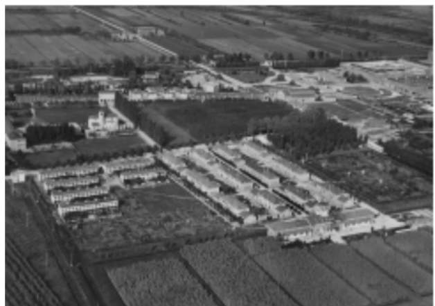
Torviscosa workers' housing in the 60s, aerial view (source: Archivio storico SNIA Viscosa, FFSC_A25-35).