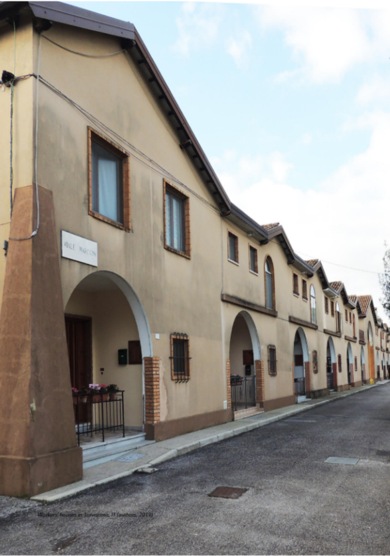
Workers' houses in Torvecasa, Il Faubourg, 2019