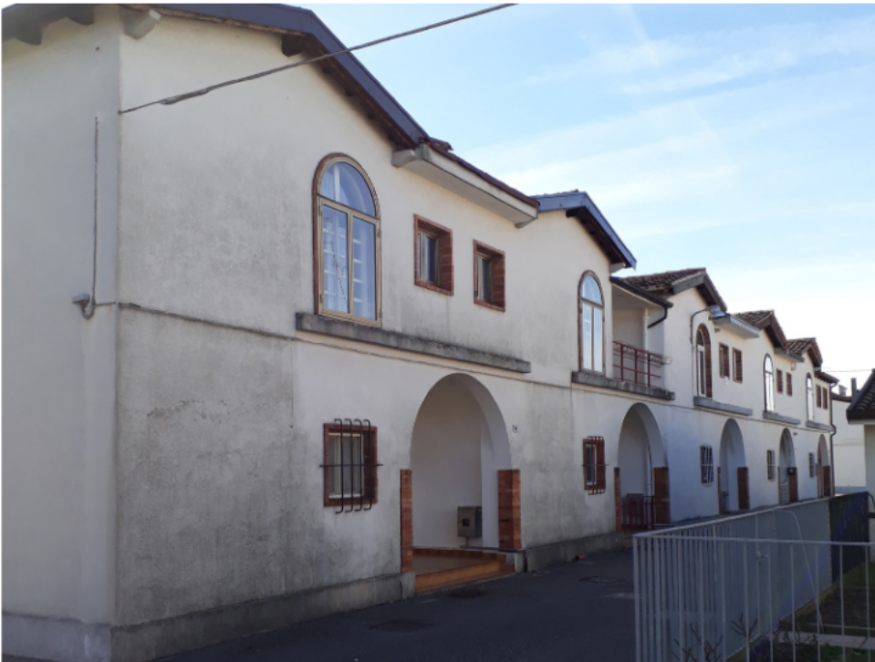
Figure 19. Workers' houses type 01M in Torviscosa, IT (authors, 2018).