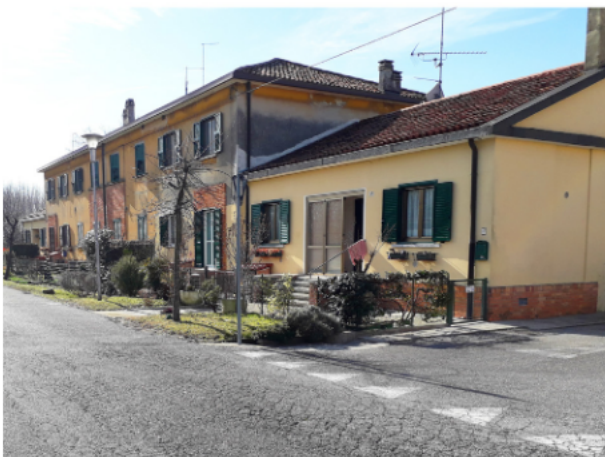
Figure 18. Workers' houses type 01M in 1945, Torviscosa, IT