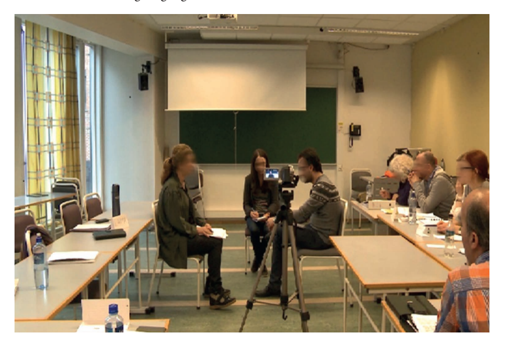
Figure 1: Illustration of role-plays in mixed language groups with participants from three different working languages: Italian, Lithuanian and Sorani Kurd

with scripted role-plays and then move on to role cards. If the role-play (script or role card) sketches a complex situation that is time consuming to play out, students can take turns sitting the part of the interpreter.