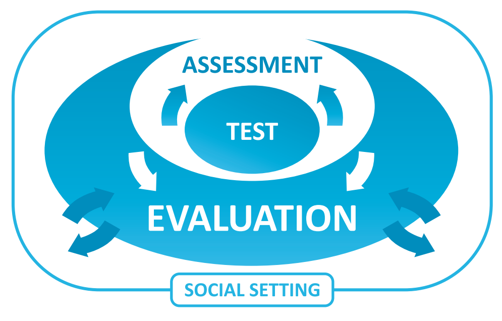
Figure 1: Evaluation concepts construct

As can be seen in Figure 1, the concepts of test, assessment and evaluation exist in a relationship of interdependence and the evaluative output feeds the social environment with information. In many cases, though, this social environment is conditioning the way the information appears in it, since norms, specific ideas and social experiences are affecting them.