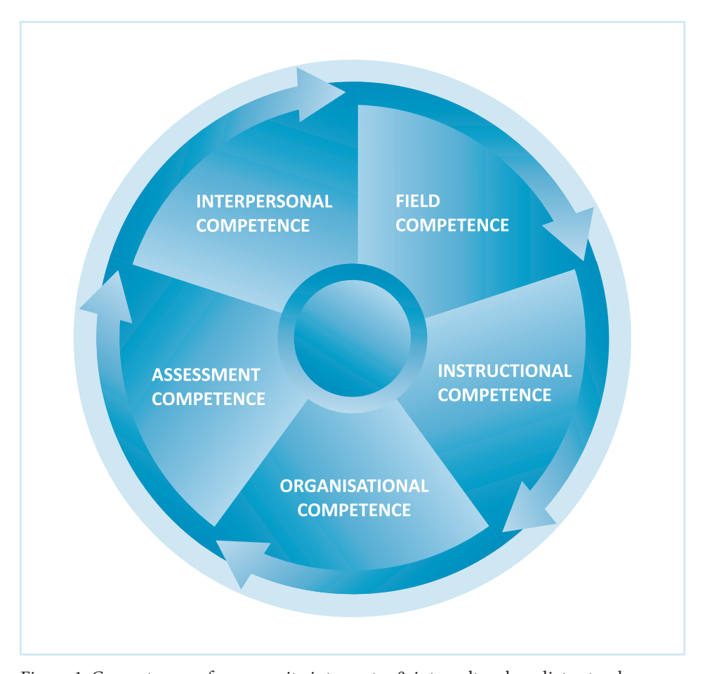
Figure 1: Competences of community interpreter & intercultural mediator teachers.

The competences listed below are not presented in order of importance. They have each been classified into one domain for the sake of clarity, although some competences may be argued to belong to more than one domain.