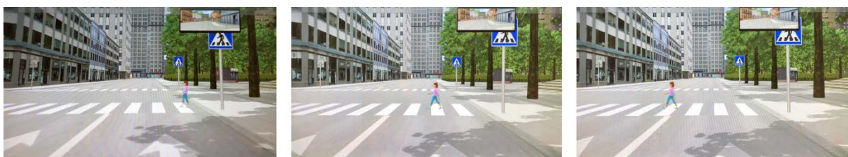
Figure 1. Crosswalk scenario in the driving simulator

While driving in the experimental scenario, the participants of both groups experienced a traffic event: a girl crossed the road on the pedestrian crossings, starting from the sidewalk. Figure 1 shows the driver's view of the pedestrian scenario as represented in the driving simulation. This traffic event took place on a four-lane road with two lanes in each direction separated by a continuous centre line, where the speed limit was 50 km/h. The crosswalk has been designed by placing appropriate markings and traffic signs for pedestrian crossing according to Norwegian road standards. The traffic event was scripted so that the pedestrian would start moving from a sidewalk to the zebra crossing when the driven car was about TTZ = 3 s from the crosswalk itself, at a speed of 1.4 m/s in line with the reviewed literature [29]. Although the pedestrian scenario originated from the drivers' peripheral vision, the drivers had a clear view to the pedestrian and the zebra crossing from 200 m in advance the crosswalk, where a red traffic light forced the participants of both groups to stop.