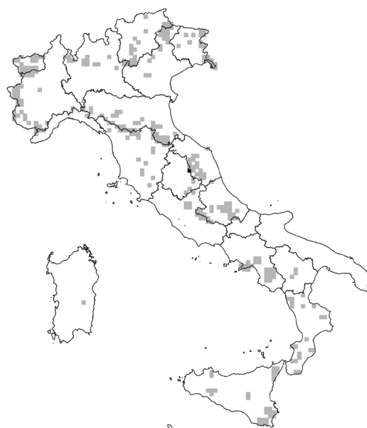
Figure 11. Distribution in Italy of the Habitat 7140: in black the new cell, in grey the cells officially reported in the 4th Habitat report ex-Art. 17 (period 2013–2018; Eionet 2019).

^ Reference plant species of the Habitat 6410, from Biondi et al. (2009).