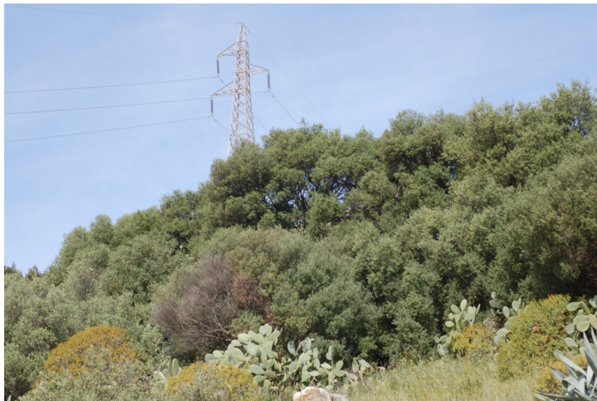
Figure 16. Habitat 9320, Olea europaea L. var. sylvestris formation at Monte San Calogero (Sciacca, SW-Sicily, Italy).

^ Reference plant species of the Habitat 9320, from Biondi et al. (2009).