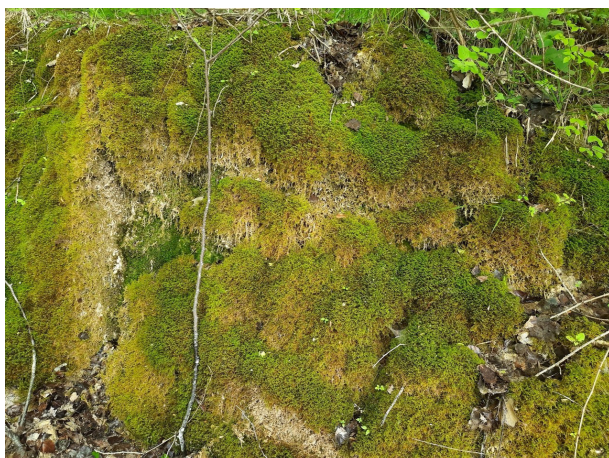
Figure 13. Overview of the habitat 7220* in the reported stand (Fiuminata, MC); the dominance of Palustriella commutata is evident.

Cell ID in the EEA reference grid: 10kmE459N161 (Fig. 15).