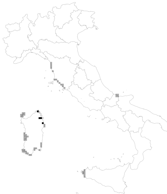
Figure 1. Distribution in Italy of the Habitat 1510*: in black the new cell, in grey the cells officially reported in the 4th Habitat report ex-Art. 17 (period 2013–2018; Eionet 2019).

Geographic information: unpublished relevés: #27a: Italy, Abruzzo, Teramo, Torre del Cerrano, 0 m a.s.l., Coordinates: 42.59306 N, 14.08217 E (Tab. 3, Rel. 1); 1 m a.s.l., Coordinates: 42.59104 N, 14.0839 E (Tab. 3, Rel. 2); 1 m a.s.l., Coordinates: 42.58943 N, 14.08512 E (Tab. 3, Rel. 3); Italy, Abruzzo, Chieti, Foro, 2 m a.s.l., Coordinates: 42.39233 N, 14.34526 E (Tab. 3, Rel. 4); #27b: Italy, Molise,