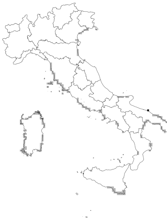
Figure 3. Distribution in Italy of the Habitat 2250*: in black the new cell, in grey the cells officially reported in the 4th Habitat report ex-Art. 17 (period 2013-2018; Eionet 2019).