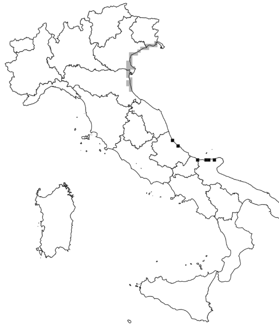
Figure 2. Distribution in Italy of the Habitat 2130*: in black the new cell, in grey the cells officially reported in the 4th Habitat report ex-Art. 17 (period 2013-2018; Eionet 2019).