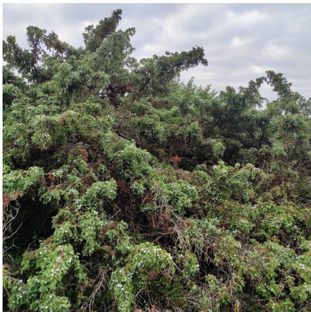
Figure 4. Habitat 2250* in the Regional Natural Park “Costa Ripagnola” (Apulia).

^ Reference plant species of the Habitat 2250*, from Biondi et al. (2009).