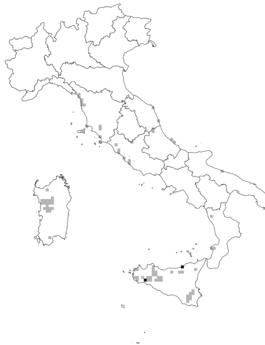
Figure 7. Distribution in Italy of the Habitat 5230*: in black the new cell, in grey the cells officially reported in the 4th Habitat report ex-Art. 17 (period 2013–2018; Eionet 2019).