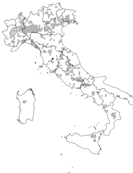
Figure 6. Distribution in Italy of the Habitat 3260: in black the new cell, in grey the cells officially reported in the 4th Habitat report ex-Art. 17 (period 2013–2018; Eionet 2019), in white (black outline) the cells later reported for Umbria region (Riviaccio et al. 2020).