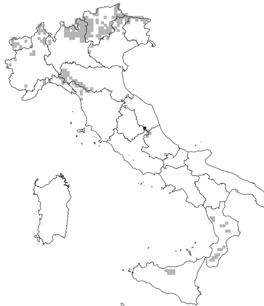
Figure 10. Distribution in Italy of the Habitat 6410: in black the new cell, in grey the cells officially reported in the 4th Habitat report ex-Art. 17 (period 2013–2018; Eionet 2019).

Notes: Two residual monospecific populations of Sphagnum , probably relict of the late glacial period (Brugiapaglia 2007), are found in wet karst sink-hole environment, in the Sibillini Mountains (Central Italy) at an altitudinal range from 1274 m a.s.l. on Pian Grande, to 1332 m a.s.l. on Pian Piccolo (Aleffi and Cortini Pedrotti 1998). Here, they represent the southern limit of the peat-bog vegetation of the continental and boreo-alpine European vegetation, and therefore have a great value from a biogeographical point of view. Since this Habitat is located outside its optimum range, it shows a strong impoverishment of the floristic composition and a loss in characteristic/diagnostic species: in fact, it is represented here by small and fragmented plant communities, allowing only a weak formal syntaxonomic classification.