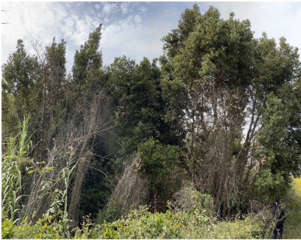
Figure 9. Habitat 5230*: Laurus nobilis formation at Contrada Dragonara (Santa Margherita Belice, SW Sicily, Italy).