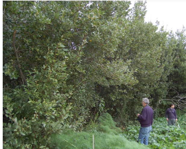
Figure 8. Habitat 5230*: relict aspects of Laurus nobilis formation near Vallone Mascarino (S. Fratello, NE Sicily, Italy).

largest of which is more than 1.5 hectares (Fig. 9). In this area, characterized by calcarenitic substrates, the laurel has a high potential by building dense phytocoenoses in the valleys and gorges as well as creating hedges and borders between the fields that define agricultural landscapes with high diffuse naturalness that are the result of the long interaction between human history and nature of this area of Sicily (Bazan et al. 2019, 2020).