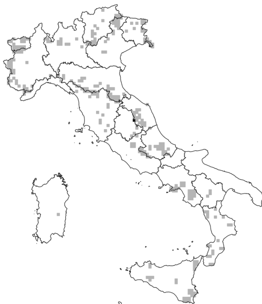
Figure 12. Distribution in Italy of the Habitat 7220*: in black the new cell, in grey the cells officially reported in the 4th Habitat report ex-Art. 17 (period 2013-2018; Eionet 2019).