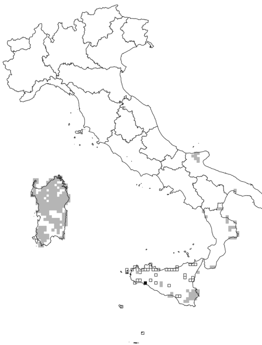
Figure 15. Distribution in Italy of the Habitat 9320: in black the new cell, in grey the cells officially reported in the 4th Habitat report ex-Art. 17 (period 2013–2018; Eionet 2019), in white (black outline) the cells later reported by Gianguzzi et al. (2020) and Bazan et al. (2021).