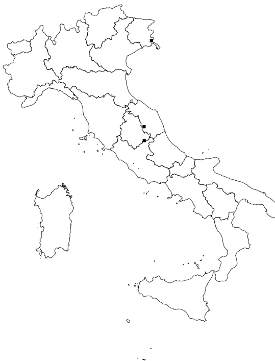
Figure 5. Distribution in Italy of the Habitat 3180*: in black the new cells.

Phytosociological reference: this habitat includes a complex of vegetation types, the most significant of which belong to: Fontinalion antipyreticae W. Koch 1936, Leptodictyetalia riparii Philippi 1956, Platyhypnidio-Fontinalietea antipyreticae Philippi 1956; Bidentetetea Tüxen et al. ex von Rochow 1951; Isoëto-Nanojuncetea Br.-Bl. & Tüxen in Br.-Bl. et al. 1952; Eleocharito palustris-Sagittarion sagittifoliae Passarge 1964, Oenanthetalia aquatica Hejný ex Balátová-Tuláčková et al. 1993, Phragmito-Magnocaricetea Klika in