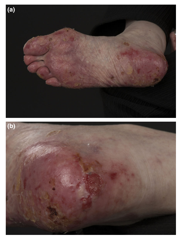
Figure 1 (a) The patient's right plantar foot showing keratoderma and (b) a friable nodule on the heel.

Histological analysis of the lesion proved to be challenging. An initial punch biopsy showed an ulcerated tumour comprised of islands of monomorphic cells with duct formation pushed deep into the dermis, and a lacelike pattern of infiltration. At this point, a diagnosis of eccrine porocarcinoma was favoured over poroma, owing to the presence of desmoplastic response and focal