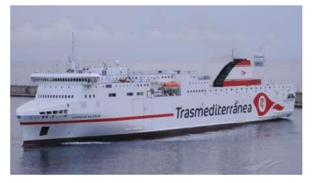
Figure 2: Comparable medium sized ROROPAX vessel

The pilot application will be tested on a medium-size passenger ferry which is currently under construction at Visentini shipyard in Porto Viro. UNITS will sign an agreement with the shipyard, which will put the ship and its Wi-Fi network at disposal free of charge l. The ship is 203 m long overall, has 151 passenger cabins and 32 crew cabins on four decks, and can carry 400-1000 passengers depending on the length of the voyage, along with 260 cars. A sample of similar sized ROROPAX vessel is shown in Figure 2.