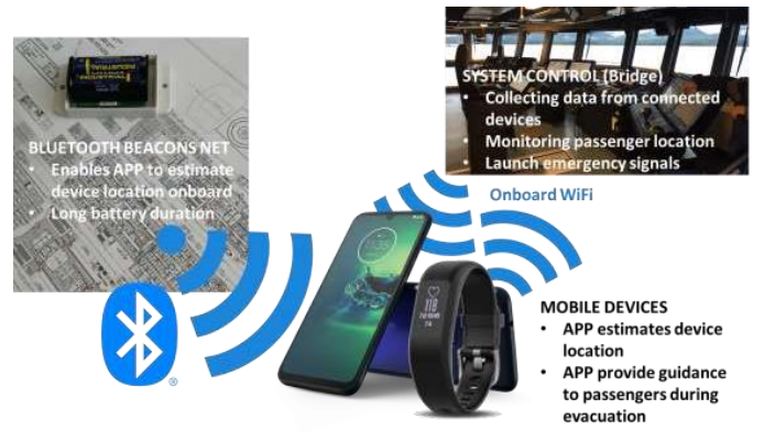
Figure 1: Schematic view of the pilot arrangement and communication between components

In both modes, the APP transmits the device position to the Backend, which shows the location of the connected devices on the ship general arrangement. Both the APP and the Backend will record the data in a log file. The function mode will be selected using the backend application and automatically transmitted to all connected devices. Schematic view of the pilot and its components is shown in Figure 1.