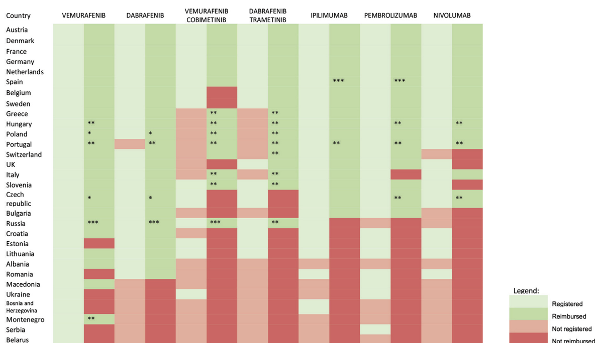
Fig. 1. Registration and reimbursement of innovative medicines in Europe on October 1, 2016. *Reimbursed, but only for first-line treatment; **Reimbursed, but with large and time-consuming administrative work needed to obtain the medicine for the patient; ***Reimbursed, but not fully available due to the restrictions in the hospital budget.

treatment. In 13/30 (43%) countries (all from Eastern Europe), BRAFi + MEKi combination was not available at all. In addition, BRAF inhibitor (BRAFi) was reimbursed in two countries (Poland, Czech Republic) only as first-line treatment. In the Russian federation, vemurafenib with or without cobimetinib and dabrafenib were not readily available because of hospital budget restrictions.